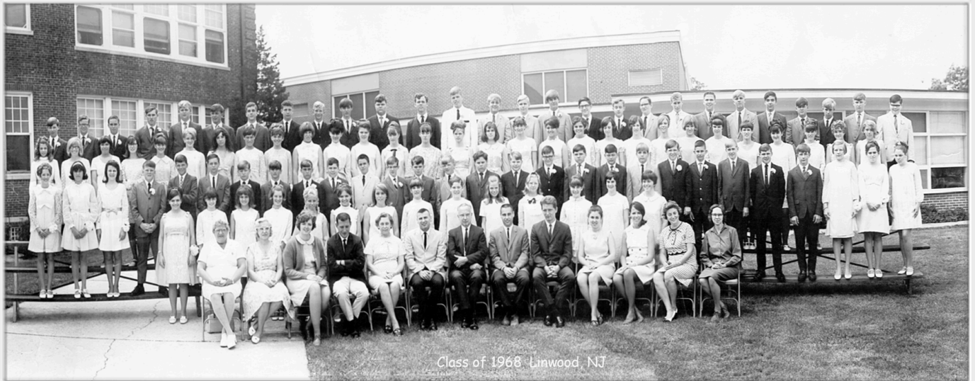
1968 & 1969 8th Grade Graduates