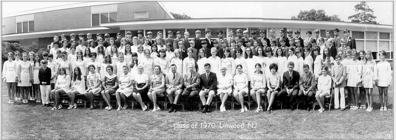
1970 & 1971 8th Grade Graduates